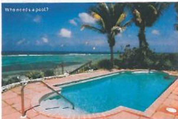
Who needs a pool?