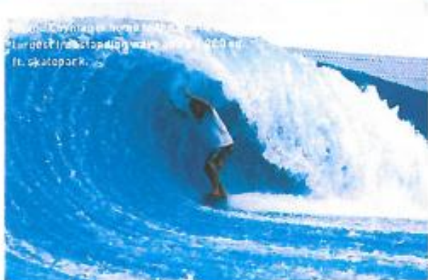
Local surfing is home here. The largest tropical wave pool is a 600-sq-ft skatepark.