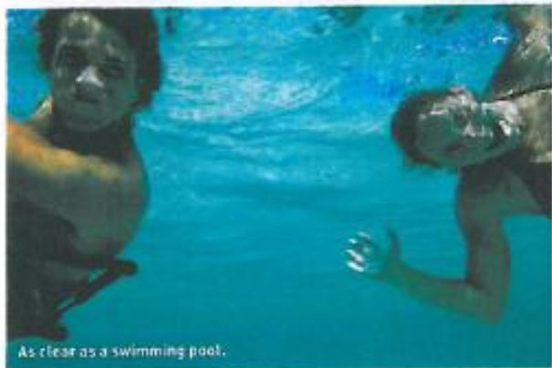
As clear as a swimming pool.